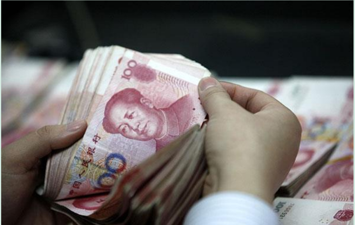
A Chinese clerk counts RMB (renminbi) yuan banknotes at a bank in Huaibei city, East China's Anhui province, January 22, 2015.

China has taken major strides in terms of social security and protection. Policies have been built on a combination of social insurance, social assistance and welfare services. And of major importance is the nine-year free and compulsory education for all. Increasingly larger percentages of the population, including the most vulnerable groups, such as poor rural residents, the unemployed and—to a gradually larger extent—migrant workers, have been included in social policies. Minimum living standards schemes, as well as medical insurance and pension schemes have been introduced, although with a fragmented structure and variations in organization, scope of implementation, entitlements and benefit generosity based on people's hukou (household registration) status and other criteria. Therefore, benefits are for many very modest.