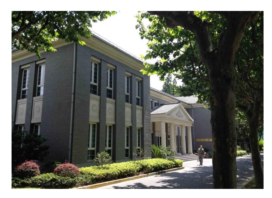
The Nordic Centre building