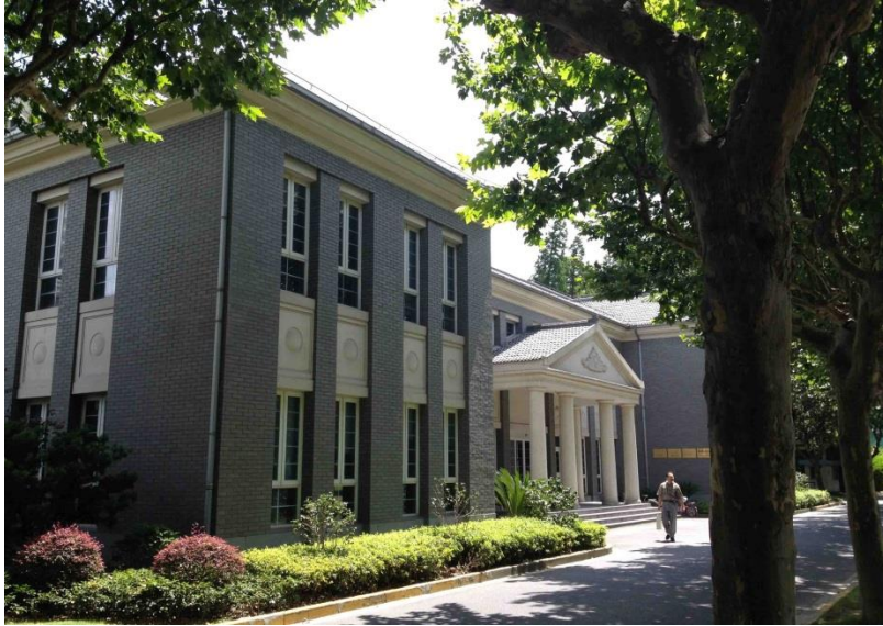
Nordic Centre building