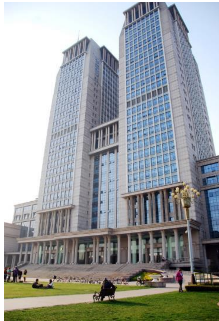
Guanghua Towers at Fudan University